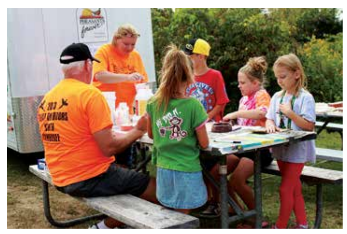
Chapter volunteers helped put on the first ever Youth Jamboree in Michigan this summer.