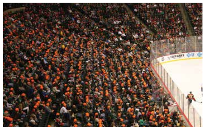
Orange hats dot the crowd at the Minnesota Wild game on October 5 sponsored by Gander Mountain, Remington and Pheasants Forever.