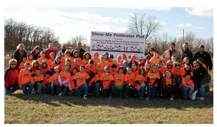
The brand new youth habitat education program in 2013 created 13 projects that had 819 youth, with the help of 111 adults, planting 26 acres of pollinator habitat in their communities. These projects will help both the birds and the bees!

And 2013 was a banner year with more youth events and participants than ever before. Chapters and partners really stepped up to sponsor shooting teams, help with youth habitat projects, host community outdoor days and continue to hold youth mentor hunts around the country. Their grassroots efforts made it possible for almost 50,000 youth to have fun in the outdoors.